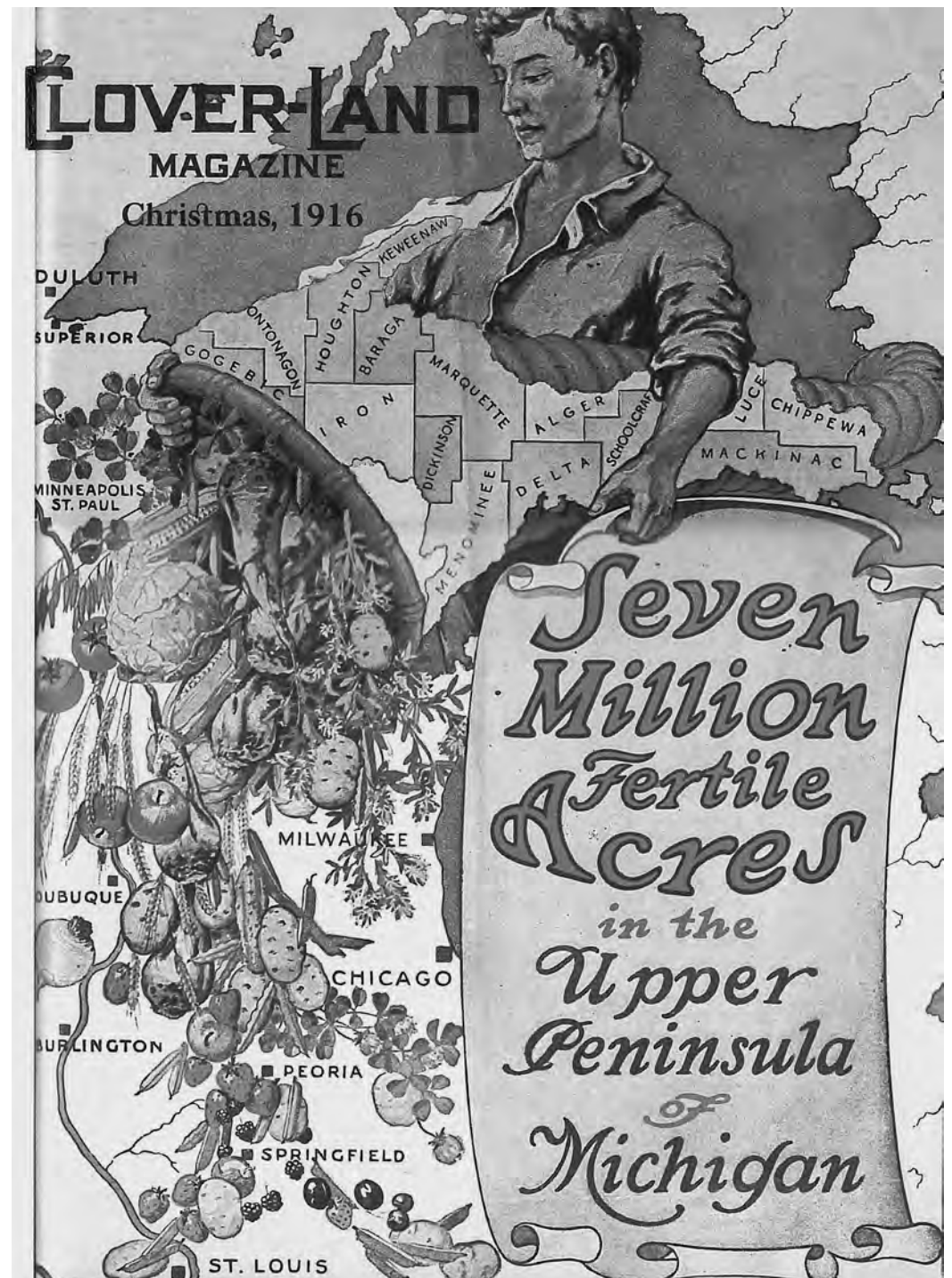
Image and description courtesy of The Central Upper Peninsula and Northern Michigan University Archives

[Image and description courtesy of The Central Upper Peninsula and Northern Michigan University Archives]