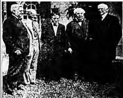
Lorem ipsum dolor sit amet, consectetur adipiscing elit, sed do eiusmod tempor incididunt ut labore et dolore magna aliqua. Ut enim ad minim veniam, quis nostrud exercitation ullamco laboris nisi ut aliquip ex ea commodo consequat. Duis aute irure dolor in reprehenderit in voluptate velit esse cillum dolore eu fugiat nulla pariatur. Excepteur sint occaecat cupidatat non proident, sunt in culpa qui officia deserunt mollit anim id est laborum.